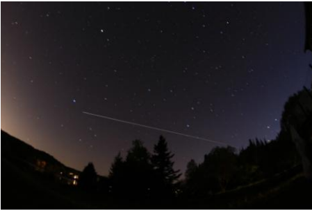
(Internat'l Space Station over Petit Lac Long. Photo Credit: Richard Swieca)